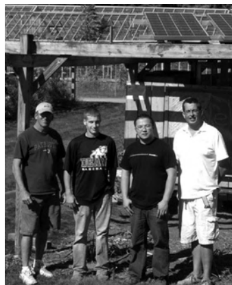
Thanks to the Sunshine Advantage team for designing and installing our new solar system!

energy, but it is also a great way to introduce renewable energy to young children. One of Sunshine Advantage's core values is to help educate and establish energy security for local communities through solar systems, so we were thrilled to partner with the company on this project. Located in Needham, Sunshine Advantage, LLC provides photovoltaic system design, building and integration services for commercial and residential properties. For more information, please visit www.sunshineadvantage.com .